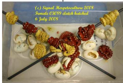
08056—08075 Hatched 6 July 2008. 10 red & 10 yellow neonates.

SIGNAL HERPETOCULTURE , P.O. Box 204, Signal Mountain, TN. 37377 Rico Walder: Owner Phone/Fax: 423.886.3029 rico@signalherp.com www.signalherp.com