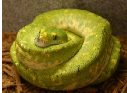
Biak type male owned by Ed Bradley.