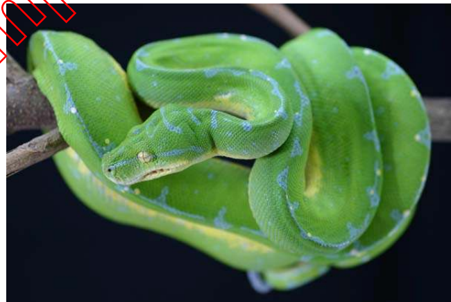
Male ID# 03062 Farm bred Manokwari type.

08152—08163 Hatched 12 August 2008. Artificial incubation. All yellow neonates.