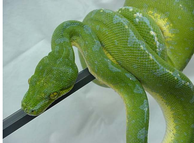
Sire ID# 96004 Origin: Imported 1996