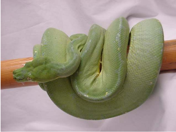
Dam ID# EA9604 Origin: Imported 1995