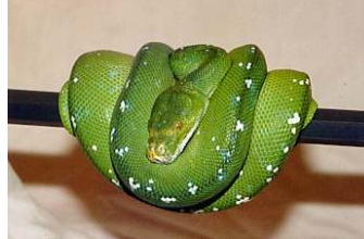
Female # 97051 Indonesian Import Locality: Aru islands