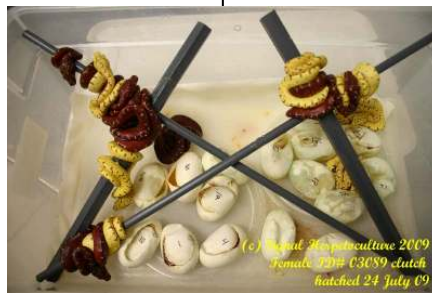
09090—09104 Hatched 24 July 2009. 7 red & 8 yellow neonates.

SIGNAL HERPETOCULTURE , P.O. Box 204, Signal Mountain, TN. 37377