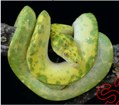
Female Biak type ID# 03089 Hatched 11 May 2003 Produced by Ed Bradley