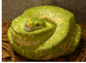
Biak type male owned by Ed Bradley.