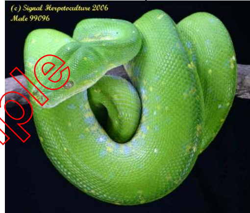
Male ID# 99096 Hatched 4 August 1999