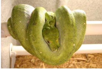
Biak type female owned by Ed Bradley.