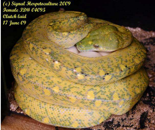
Female ID# 04095 Hatched 31 July 2004 CBB at Signal Herpetoculture