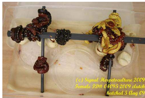
09122—09139 Hatched 5 August 2009 Artificial incubation, 14 maroon & 4 yellow.

Signal Herpetoculture, P.O. Box 204, Signal Mtn., TN 37377 Rico Walder, Owner 423.886.3029, www.signalherp.com