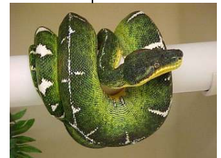
Male NP-97-03 "Apollo" Owned by Noe Perez