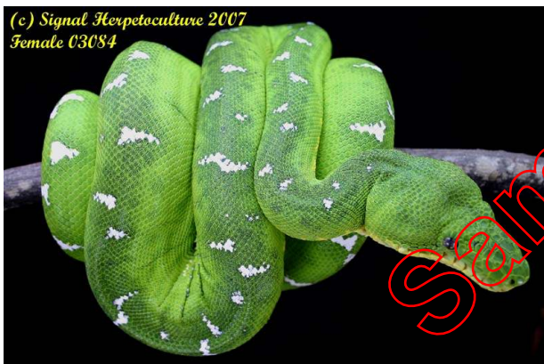
Female ID# 03084 Born 24 September 2003