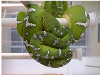
Dam: ID# 97017 W.C. Import