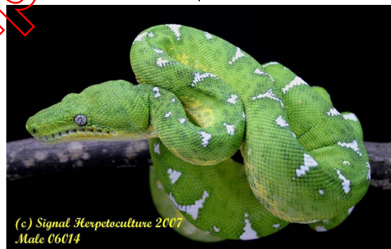
Male ID# 06013 Born 4 August 2003 Produced by Noe Perez.