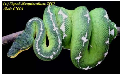
Sire: ID# 01004 W.C. Import