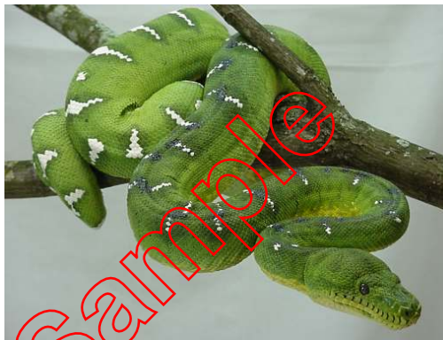
Dam 01007 W.C. Import