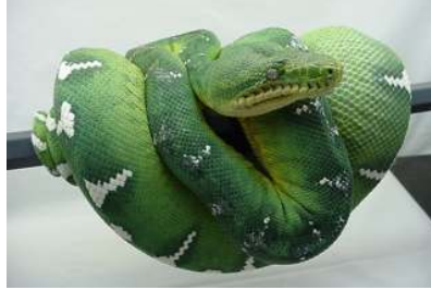
Dam 01078 W.C. Import Acq. From D. Jolly Sept 2001