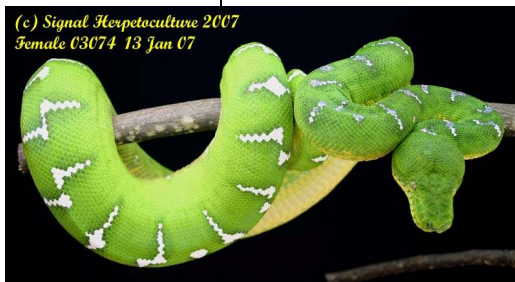
Female ID# 03074 Born 3 September 2003