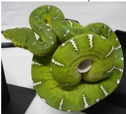
Sire 97007 CBB 1997 Produced by D. Jolley