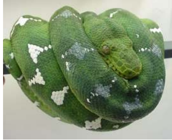
Sire 01077 W.C. Import Acq. From D. Jolly Sept 2001