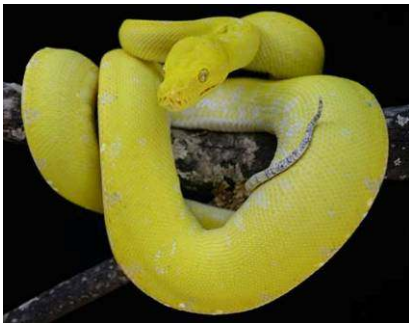
Female ID# 05028 Indonesian Import 2005 Kofiau Island type