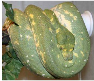
Female Biak type ID# UK0402