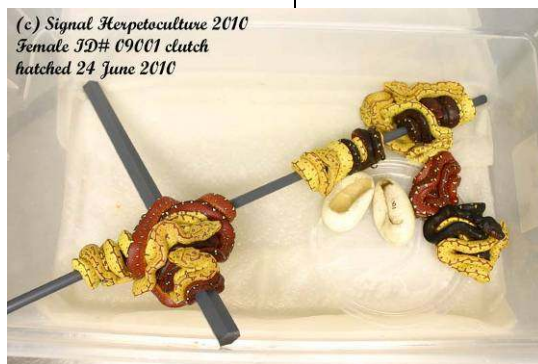
Clutch hatched 24 June 2010. 6 Maroon and 7 yellow