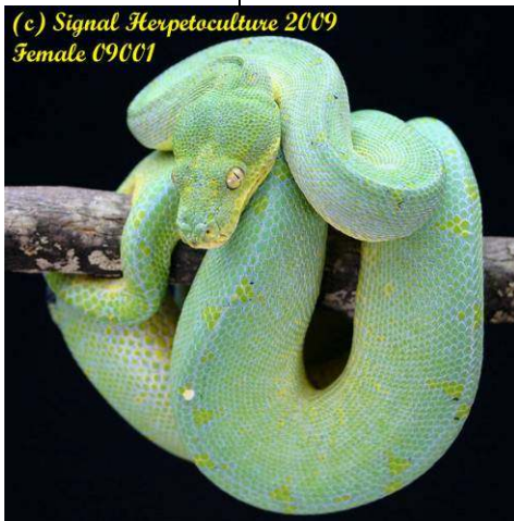
Female ID# 09001 Prada line CBB Manokwari type